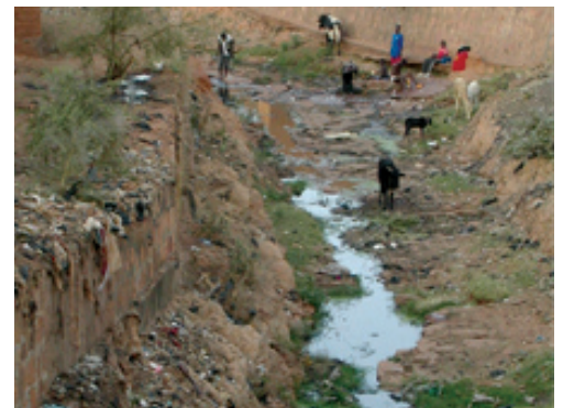
Well sited beside watercourse acting as drain and waste dump, Bobo-Dioulasso, Burkina Faso.

Sanitation has been incorporated alongside water supply in Target 10 of the Millennium Development Goals, and this signalled a greater recognition internationally. The WASH concept, promoted by the Water Supply and Sanitation Collaborative Council, argues for combining