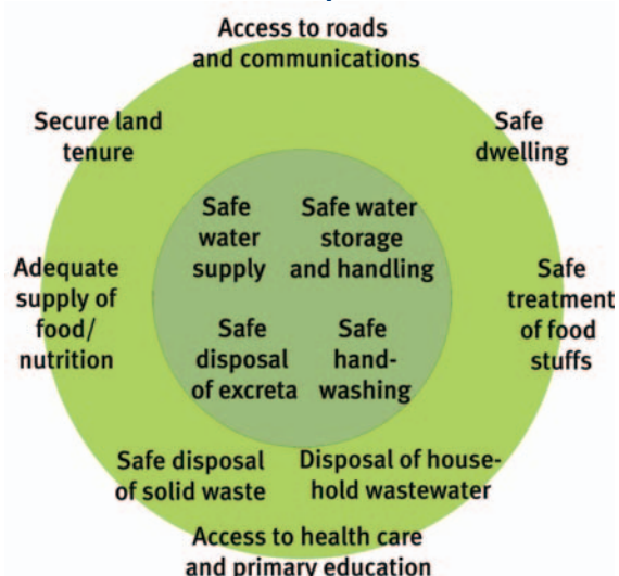
Figure 1: Basic services and safe practices

The above considerations cast doubt on the wisdom of systematically attaching the S&H components of WASH, WSS and WES to the policy 'bandwagon' of water supply. The S&H elements, the younger sisters, are politically weaker, when compared with their elder brother. The downside