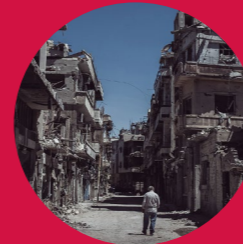
Page 4-5 Damaged buildings in downtown Homs, Syria