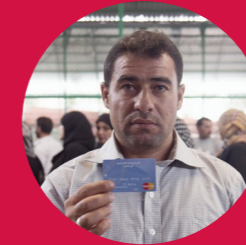
Page 7 Syrian refugees in Lebanon receive e-vouchers