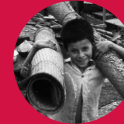
Page 12 Salvadoran refugees in Colomoncagua camp in 1990