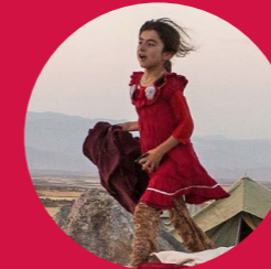
Page 11 Iraqi children in Newroz camp, Syria