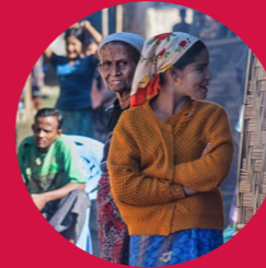
Inside cover Rohingya women in Basara IDP camp near Sittwe, Myanmar

In 2013-14, Disasters published three supplementary issues, in addition to the quarterly editions, on the 2010 Haiti earthquake, the 2011 Japan earthquake and disaster resilience. Three virtual issues were also published, on the Ebola epidemic, the tenth anniversary of the Indian Ocean tsunami and the 3rd World Conference on DRR.