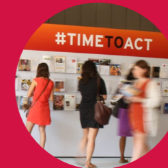
Page 10 Global Summit to End Sexual Violence in Conflict fringe event