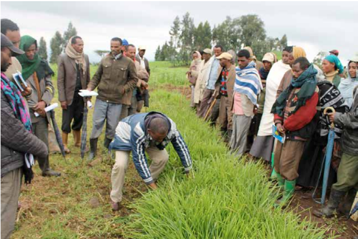
Practical training on fodder management, Jeldu