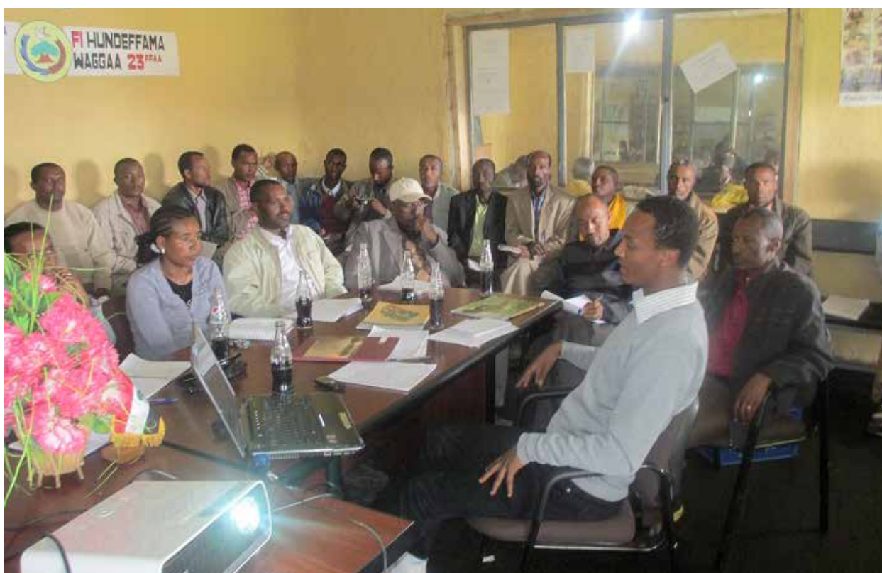
Innovation platform meeting at Jeldu district administration office