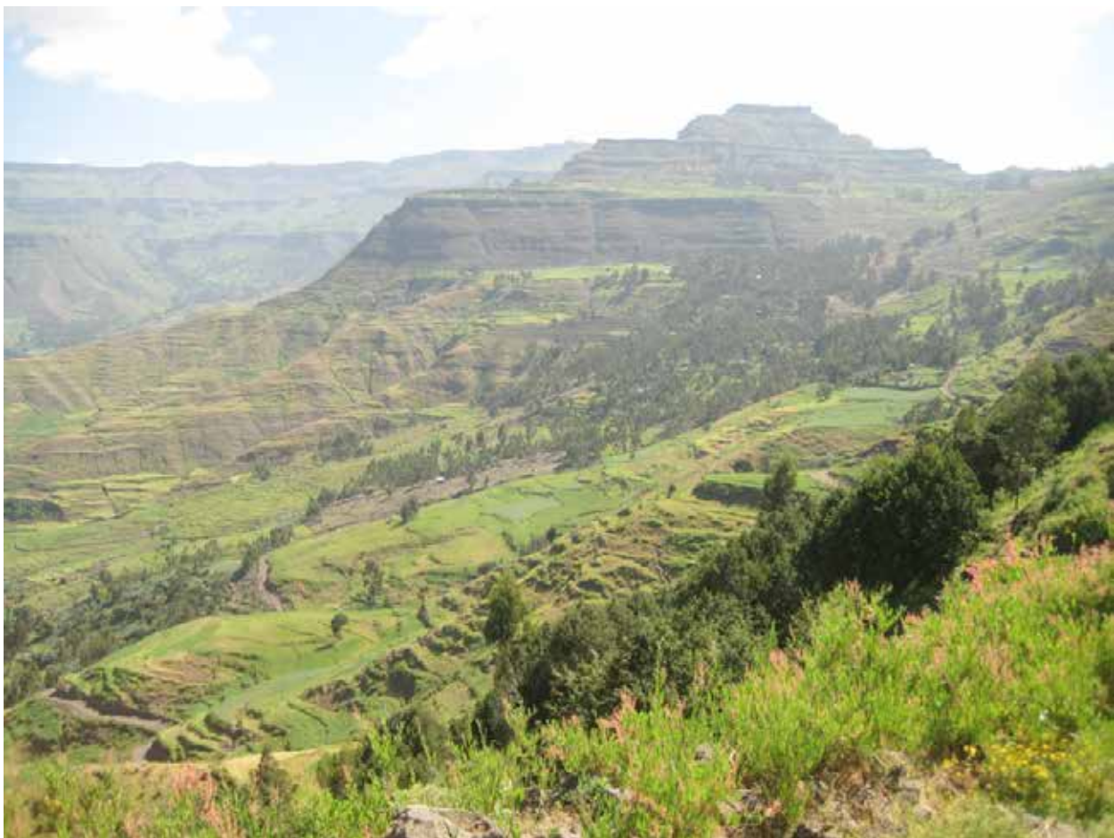
Jeldu Landscape