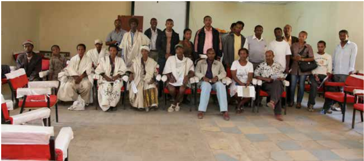
Members of the 3rd innovation platform meeting in Fogera

Equitable benefit-sharing mechanisms are perhaps required to ensure that the poor, or those with no livestock, do not lose out, for example by compensating those who lose grazing opportunities or by providing access to backyard fodder development as a substitute. In the case of Fogera, alternative income-generating activities could be designed to make up for women's loss of income from dung collection, which would result from an enclosure. Alternative fuel sources could also be explored. So far, however, the process of developing a draft bylaw to govern management of the communal areas has not been very inclusive, but driven mainly by a small group of farmers supported by the innovation platform. These farmers are relatives and already have experience of joint management of land, which make this process relatively smooth, but there is a gap in terms of capturing the views of other households and making sure that they do not face negative consequences or that they are adequately compensated if they do.