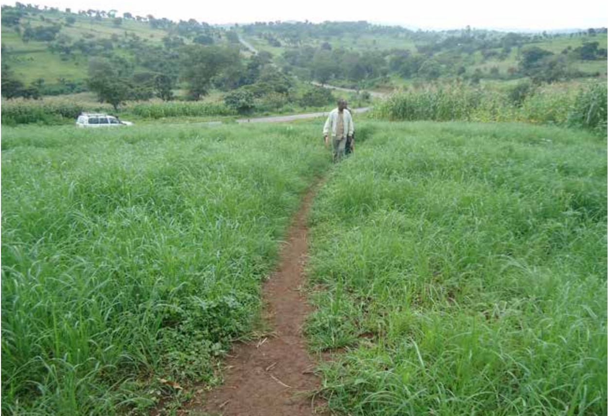
Partners from Bako ARC and Diga office of Livestock Agency visit the on farm forage development

During implementation it also emerged that the broader purpose of the innovation platforms (beyond the implementation of the fodder pilot projects) had not always been communicated effectively to communities. Follow-up interviews revealed differences in understanding among platform members themselves, with some showing limited understanding of the innovation platform philosophy and aims. This may have been due to high turnover of members from some organizations, but it could also be a result of implementing the fodder projects early in the process, so that these became the focus.