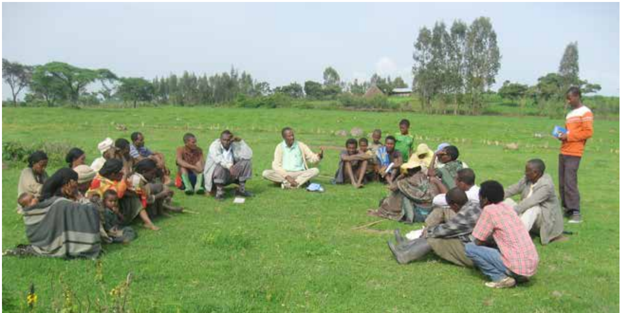
Community members from Limbichoche village, Fogera, discuss enclosure of grazing land with ILRI researchers

In Fogera, the focus was on controlling free grazing through increased livestock feed supply in order to make soil and water conservation efforts more effective. Free grazing destroys soil conservation structures, contributes to soil compaction and removes crop residues that would otherwise enhance soil fertility. Increased supply of livestock feed was expected to allow stall feeding and thereby also control free grazing, especially in the dry season. Initially, an area of communal grazing land, close to conservation structures, in Gebre Gesa village was selected for exclusion of livestock. However, the site was changed in response to the preference of local communities, and an enclosed area was eventually established in Libichosh Got (Woje Awramba kebele, in the Gunguf watershed) where free grazing was identified as a severe problem. The enclosed land covered more than 3.75 hectares and housed 60 people in 13 households. Fodder species have been planted in the enclosure, including vetiver grass, pigeon pea, cowpea, sesbania and napier grass, for cut and carry as well as land rehabilitation purposes. Two hectares of backyard were also planted with fodder. Seeds and tools were distributed to farmers and various types of training were given. The local community has also started to develop bylaws to govern use of the enclosed area.