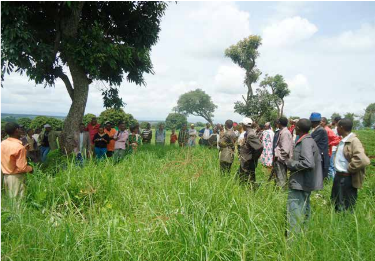
Champion farmers demonstrating the management of forage crops to fellow farmers