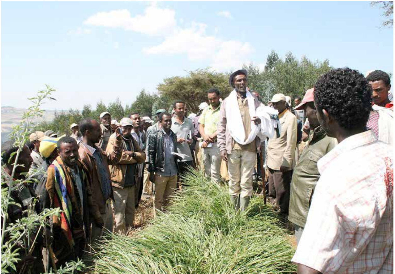
Farmer explaining his experience with Desho Grass to field day visitors at Kolu Galan, Jeldu

As in the other sites, bylaw development is an important part of the project, particularly as farmers are concerned about the risk free-grazing cattle poses to their investments. Discussion of a new bylaw is underway, but some concerns have emerged that by-law development is proceeding in a rather top-down fashion, with limited engagement of all relevant stakeholders.