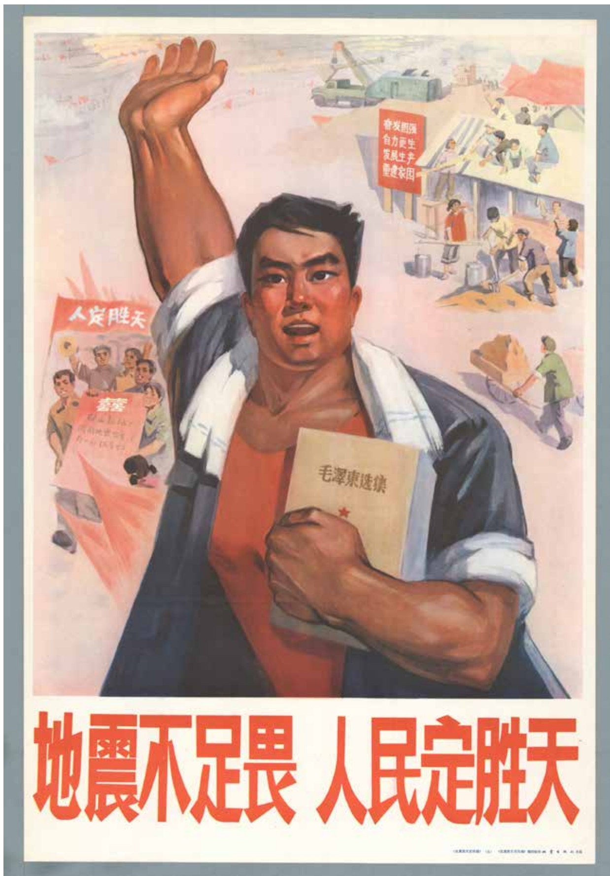
Propaganda poster referring to the Tangshan Earthquake, 1976.