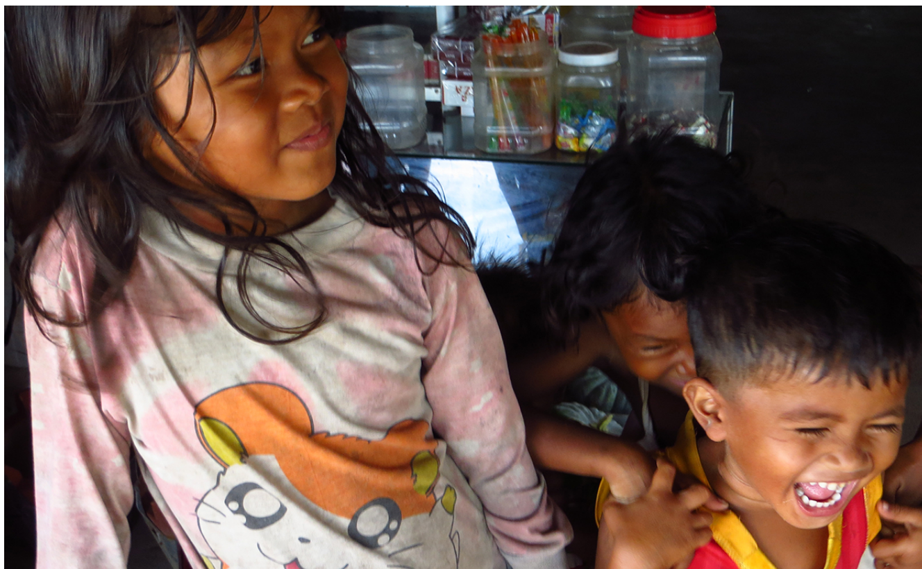
Children in Kampot, Cambodia.

Cambodia's progress in tackling NTDs provides a working model of how, by taking advantage of the drugs, funds and strategies available, NTDs can be controlled with minimal resources. NTDs' cross-cutting linkages with many other areas of development, and particularly with poverty, makes this case study a useful contribution to understanding progress towards many of the 2015 Millennium Development Goals and beyond.