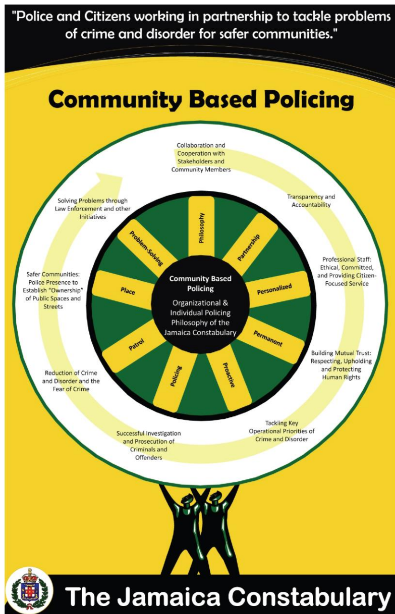
Figure 2: Community-based policing wheel