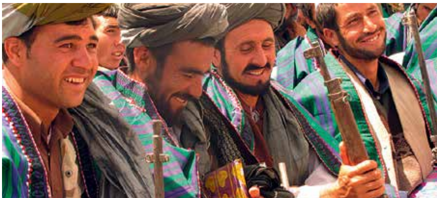
Former Taliban fighters prepare to hand over rifles to the Government of the Islamic Republic of Afghanistan, May 2012

think and act in ways that are politically smart. Demand has grown for the POGO-led training programme on political-economy analysis: in 2012 we worked with DFID, the EC, Plan UK and BBC Media Action to deliver courses and workshops, and to help them design more politically informed programmes and policies.