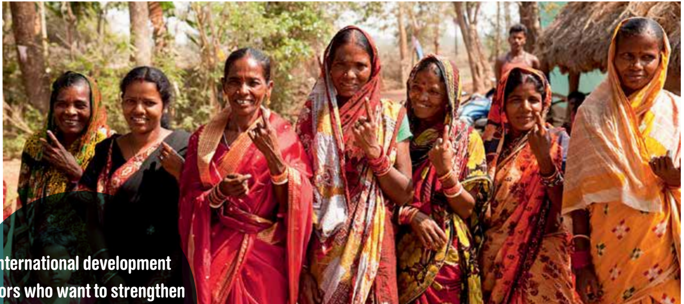
The panchayat elections in Odisha, India, in February 2012, urging women to stand for elections

International development actors who want to strengthen democracies would do well to start by focusing on parliaments