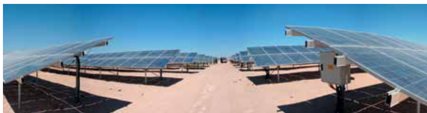
Solar panels in the desert, Chile

Climate Funds Update www.climatefundsupdate.org