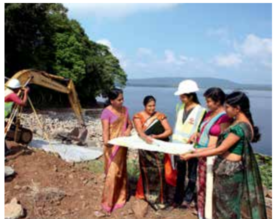
Dam under construction in Sri Lanka