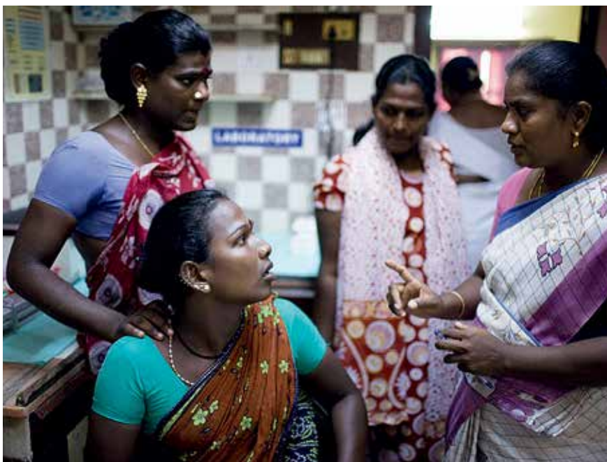
HIV and AIDS peer counselling, India