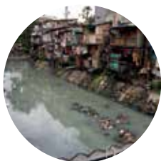
Cover photo Rehabilitating Jakarta's waterways to mitigate flood risk