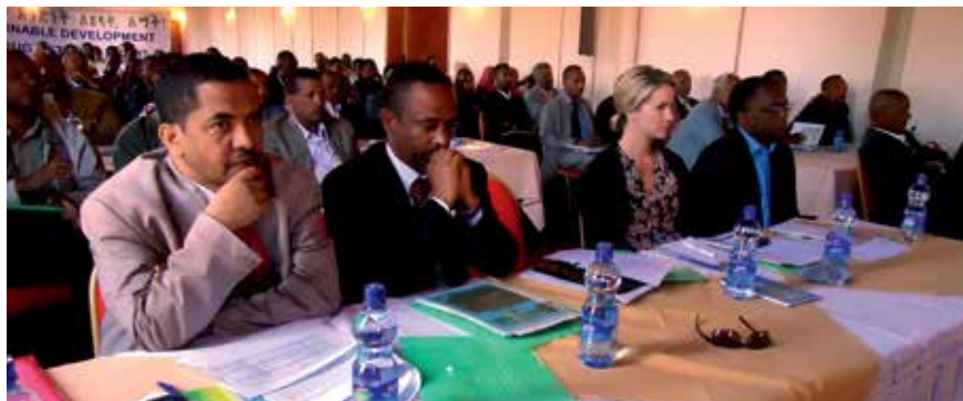
Citizen consultation on green development, Ethiopia

This initiative has helped to build the capacity of those handling grants, provided a model to test theories of change, and generated lessons on key approaches, such as outcome mapping and political-economy analysis. Above all, it has forged cross-sectoral and cross-country communities of practice for the future.