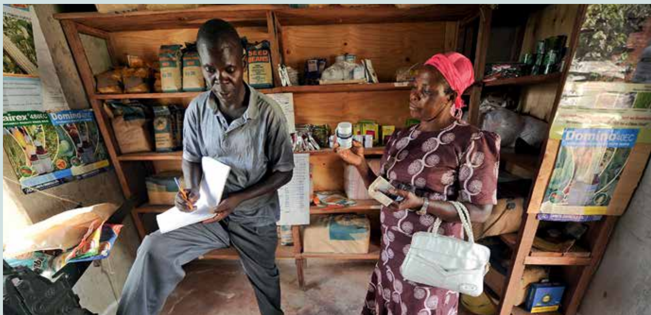
Creating diverse livelihoods in Lower Nyando, Kenya