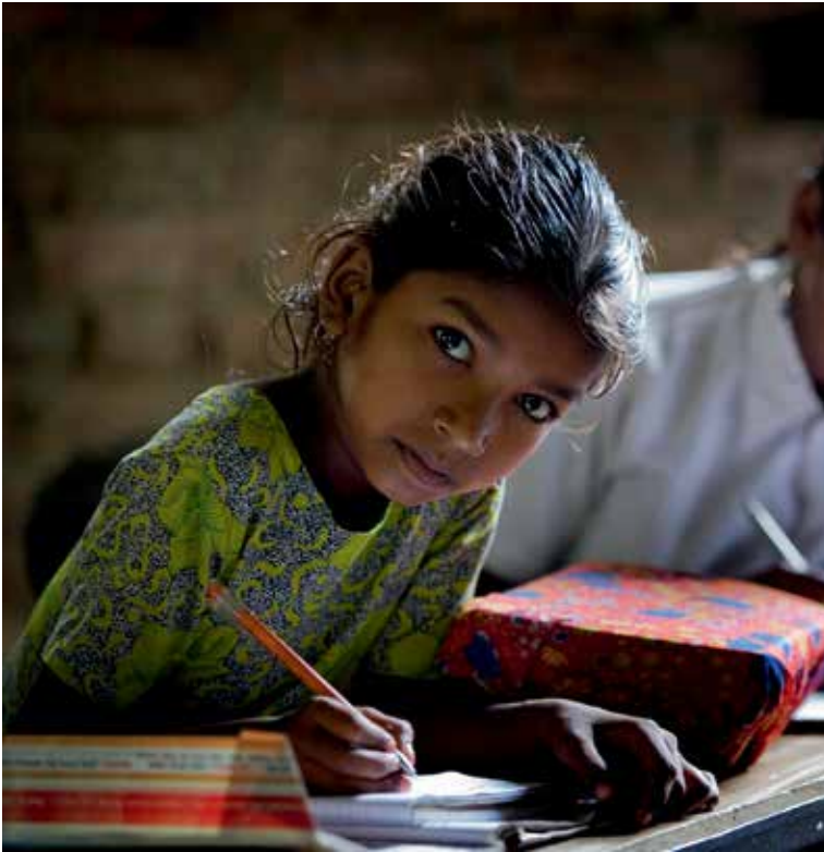
A young girl attends a school near Bhairawaha, Rupandehi District, south-central Nepal