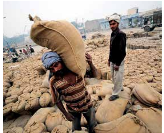
Rice-packing centre in Sangrur, south-east Punjab, India