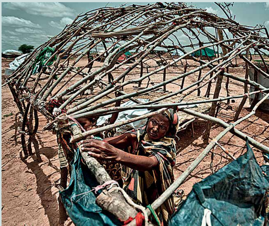
Building shelter at the Mentao Nord camp in Burkina Faso

Our Social Protection programme has launched a Shockwatch work-stream of research and policy advice to donors and governments on how best to respond to the poverty impacts of crisis events. A toolkit has been developed, informed by research visits to Mozambique and Zimbabwe in December 2012: visits that confirmed the scarcity of credible data and highlighted the need for alternative approaches to pinpoint likely risks and responses. The resulting country report on Mozambique has already been used by DFID to guide a risk-mapping exercise in the country, while the Zimbabwe country report provided a useful review of existing social-protection provision for DFID staff.