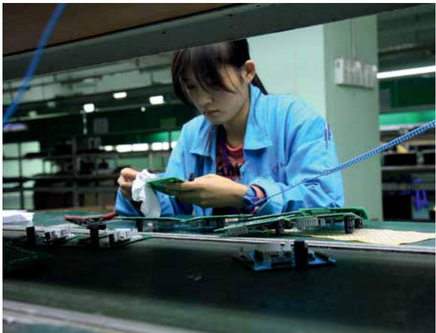
IBE electronics, Shenzhen, southern China

The report, based on an assessment of the MDG experience and analysis of the likely trends for the next 20–30 years, was enriched by case studies on Côte d'Ivoire, Nepal, Peru and Rwanda, as well as a dozen background papers by practitioners and academics. The report reaches four main conclusions: a transformative agenda is vital, national ownership will be critically important, global collective action must be scaled up, and a new framework should be as much about instruments as it is about goals. This independent annual report is funded by the European Commission and seven EU Member States: Finland, France, Germany, Luxembourg, Spain, Sweden and the UK.