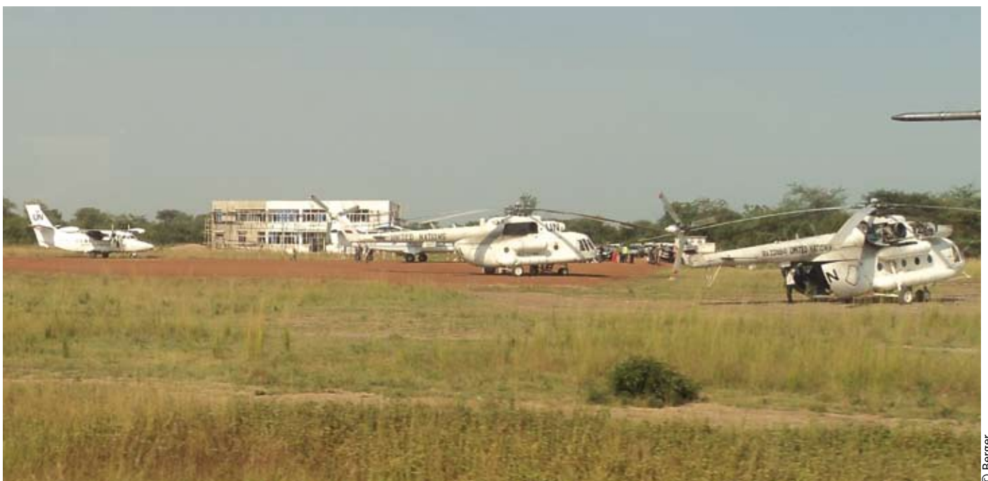
UN and WFP aircraft, Bor airstrip, South Sudan