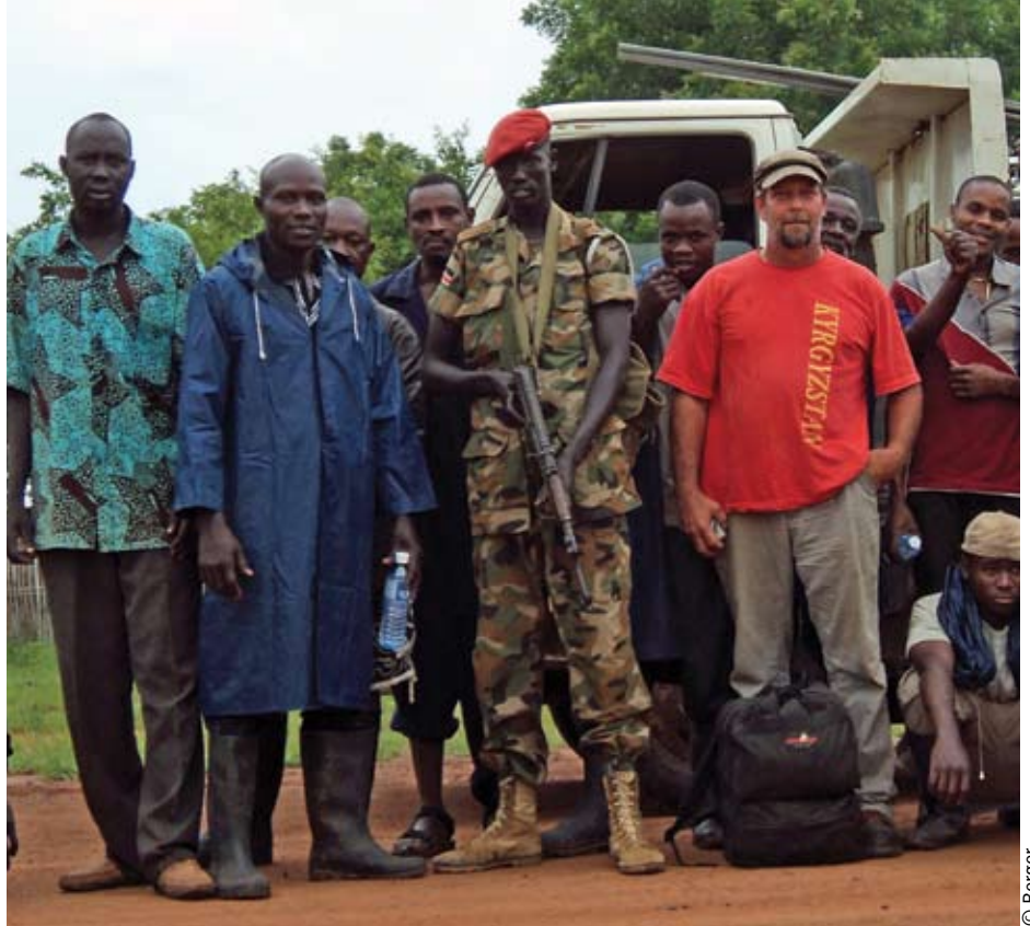
US defence subcontractor convoy, Rumbeck, South Sudan

This has created powerful incentives for aid agencies to be present and operational in chronically insecure countries. During the 1990s, when the Taliban held power in Afghanistan, the UN mission would withdraw on the slightest provocation, including in one instance the throwing of a coffee pot at a UN official (Donini, 2009: 8, fn. 14); today, even the deaths of aid workers are met with a defiant resolve to remain (BBC, 2011). Where donor governments and the UN are engaged and determined to stay, so too are the many international NGOs and consultants that subcontract for them. Those 'fragile states' deemed important to Western security are also the aid industry's most profitable areas, and where the contract culture is most active. While aid agencies like to see their presence as a reflection of programmatic or humanitarian 'criticality', it is also true that, to maintain market share, they have little choice but to follow the money (Van Brabant, 2010: 10). For international NGOs, not having a visible presence in challenging environments threatens brand loyalty, weakens