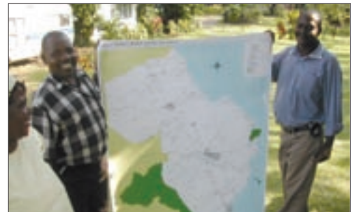
Water professionals in Salima District, Malawi, explain the district's water point map

Mapping can be useful to improve the visualisation of the spatial dimension of key development issues. It can display complex information on the local situation in a more easily accessible way than other forms of data presentation, provided data is available. Turning information into knowledge through mapping can therefore provide an important contribution to improving governance, making information on a local situation a more widely available resource. In turn, this may assist in making service delivery decisions more transparent and decision-making processes more accountable to the poor. Mapping therefore holds potential for improving governance in the delivery of basic services to the poor.