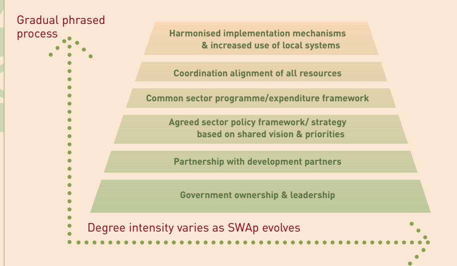
Figure 1: Elements of a Sector-wide Approach.