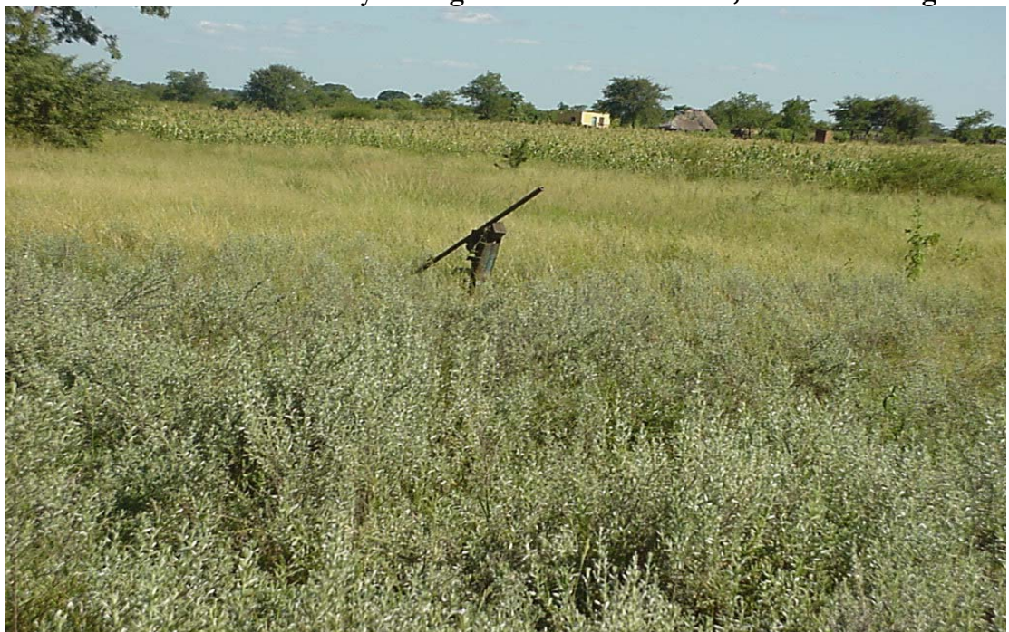
Picture 1: Defunct community managed borehole in Ward 1, Zvirodzo Village

In other instances, communities withheld their financial contributions to the water point committee because of concerns over the managing of funds. These ‘constitutional’ issues, although part of the CBM design concept, in fact were rarely addressed. None of the water points in Ward 1 and Ward 4 had a constitution. Consequently, some people in the two wards feared that water point committees would misuse their contributions. Given this financially precarious environment and lack of effective governance of the boreholes in Ward 1 and 4 of Sangwe Communal Area many of the boreholes that were communally ‘owned’ had broken down completely, such as that in the Picture 1 below.