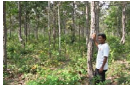
Community forestry in Cambodia: can carbon sequestration provide pro-poor financing?

T he volume of private finance flowing through the voluntary carbon market has increased significantly over recent years, with an eight-fold rise from around five million to 43 million dollars between 2004 and 2005 alone (Capoor and Ambrosi 2006). A significant proportion of these funds is destined for the developing world. What is likely to happen to all this money? Will it be used to the benefit of the developing world, providing new opportunities for growth and poverty reduction, or will it be used to satisfy commercial and industrial interests in the north, to the detriment of southern interests?