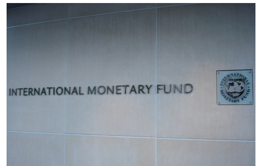
Reform at the 2007 annual meeting of the IMF and World Bank is critical.

In response, the IMFC adopted a programme of reforms aimed at adapting quotas and voice within the institution, which were to be completed by the Annual meetings of 2008, at the latest. The communiqué from the meetings stated that: '...this package of reforms, when implemented,