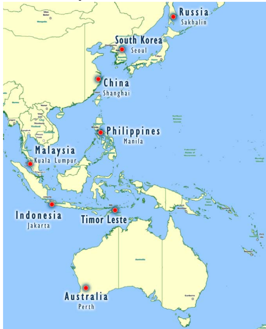
Figure 1 Map showing geographical locations of AMEC's operations in the South East Asia Region

excellence in engineering design and asset management support services and draw on AMEC's experience of providing facility management, technical integrity maintenance, operations services, and sub-contract management to an offshore gas extraction project in the Philippines (discussed further in Section 5 ).