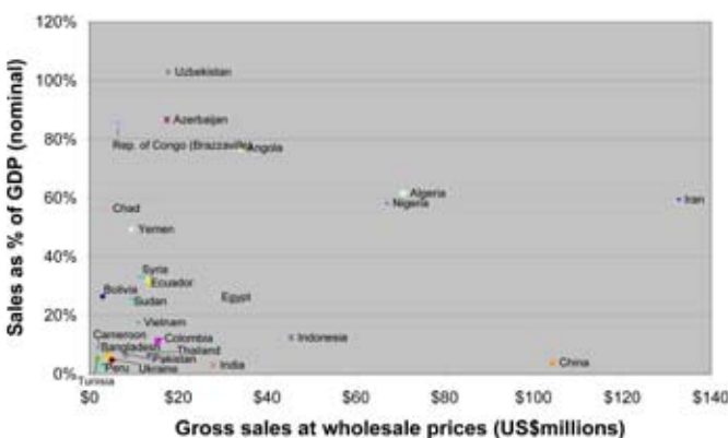
Figure 1: Sales of oil and natural gas on wholesale markets as a % of GDP (nominal) in low and low-middle income countries, 2006

Whether sales of oil and gas continue to account for such a high proportion of GDP and contribute to further growth will depend on: