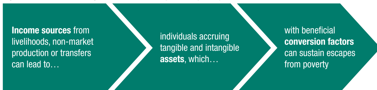
Figure 1 Process of change for sustained escapes from poverty

The next section presents a brief overview of the approach and methods employed in this study, with more details provided in the Annex. This is followed by a presentation of poverty dynamics across country studies in section 3. Section 4 follows this overview with a comparative analysis of results across countries, disaggregated by livelihood strategies, assets and conversion factors needed to ensure sustained escapes from poverty. Section 5 finally offers brief policy implications and concludes.