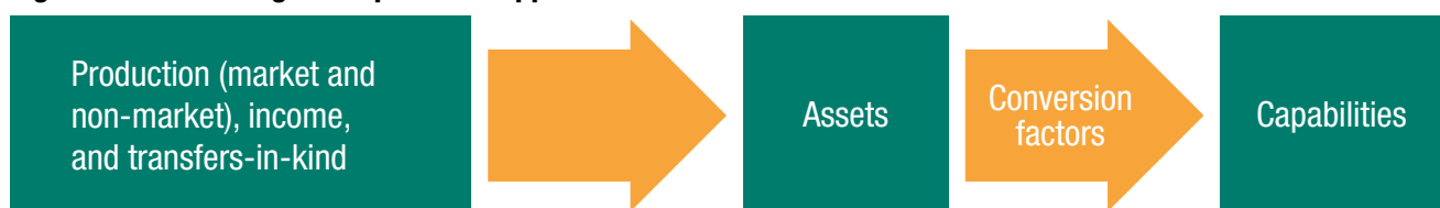
Figure 2 Visualising the capabilities approach

Conversion factors affect the ability of an asset to contribute to a sustained escape. These factors can be categorised into personal, social and environmental or other macro contextual characteristics (Table 1). 2 Conversion factors are important in the context of this study because they can help determine an individual's or household's capabilities given their endowments and asset set, including the ability to build resilience and escape poverty sustainably. These conversion factors would suggest that household resources and capacities are necessary but not sufficient indicators of well-being; rather, it is important to understand the circumstances in which people live, from the micro to up the macro contexts, that can influence their ability to sustain an escape from poverty. This study explores income sources, assets and conversion factors and the extent to which they drive or inhibit sustained poverty escapes.