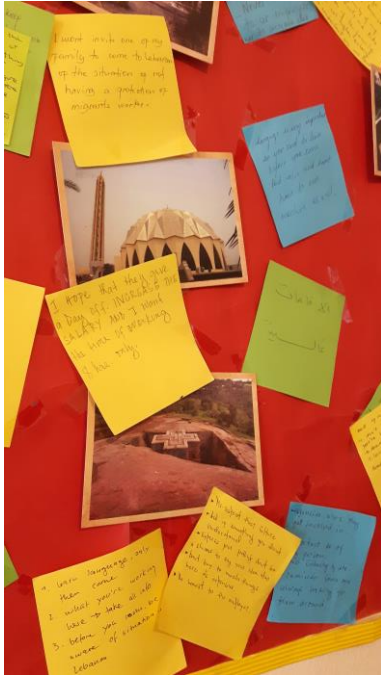
Notes by migrants at the MCC