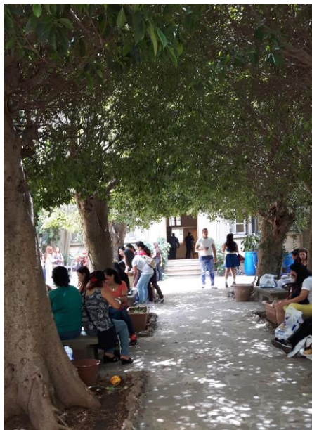
A picture taken outside the St. Francis Church in Hamra