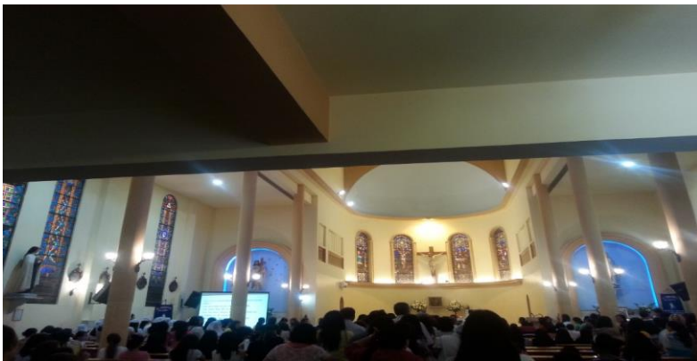
A picture taken at the mass in St. Francis Church in Hamra. The screen projector on the left displays the words of the mass in the native language of the Philippines attendees (Tagalog).