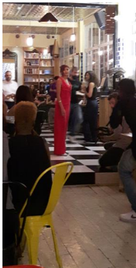
Fashion show 'Celebrating Colours 2016'