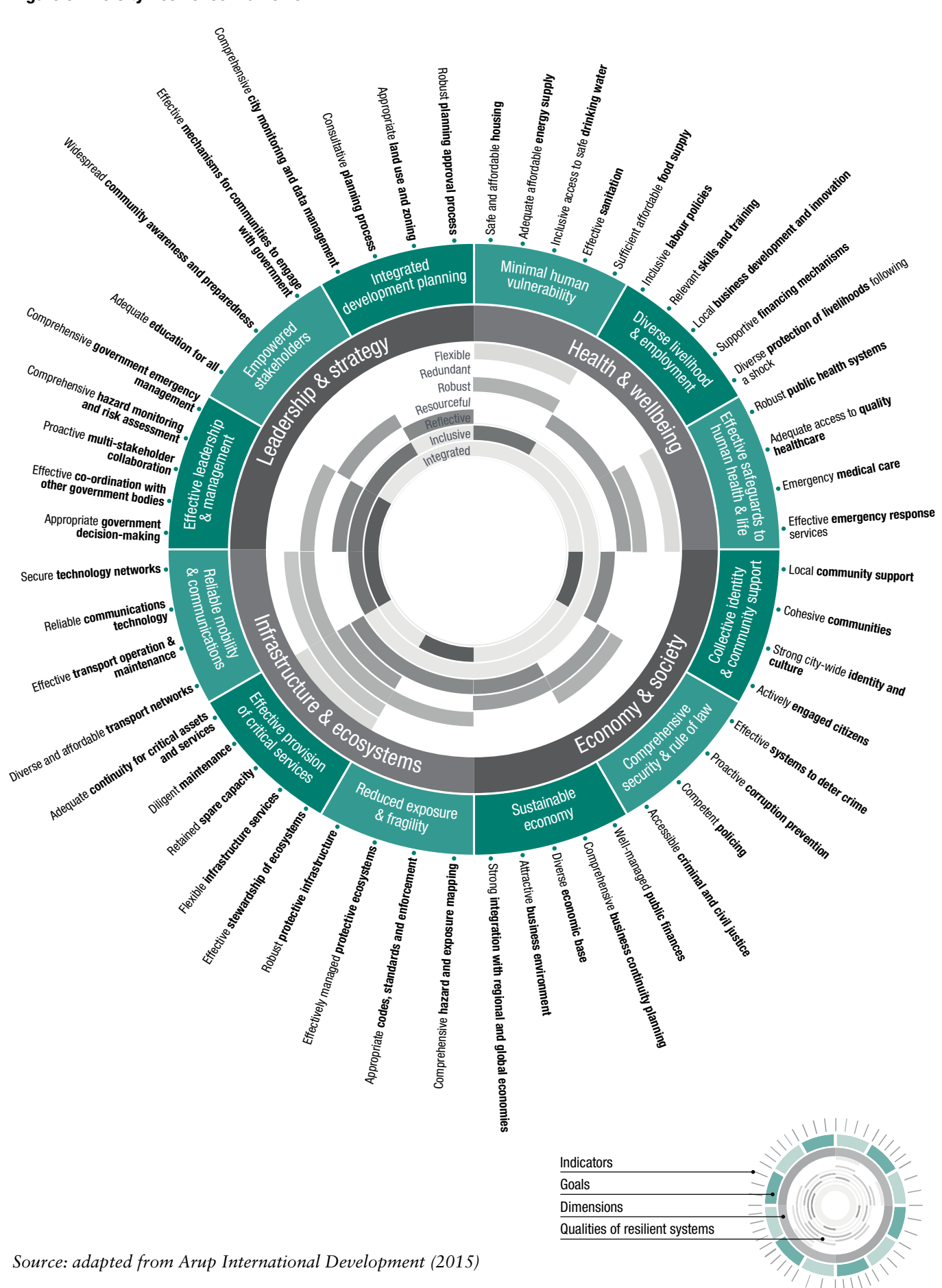
Figure 3. The City Resilience Framework